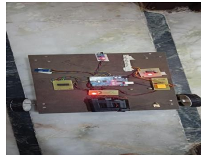
Fig 6: Result