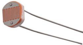
Fig. 2. Typical LDR Sensor

Most home appliances, outdoor lighting, and streetlights are normally operated and maintained manually. This is not only dangerous, but it also wastes energy due to staff negligence or unforeseeable events when turning this electrical equipment ON and OFF. Therefore, by using a light sensor, we can automatically shut off the loads based on the intensity of the daylight.