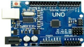
Figure 5 Arduino UNO Board

boards, such as the Arduino Mega board, etc. The board consists of digital and analog Input/Output pins (I/O), shields, and other circuits.